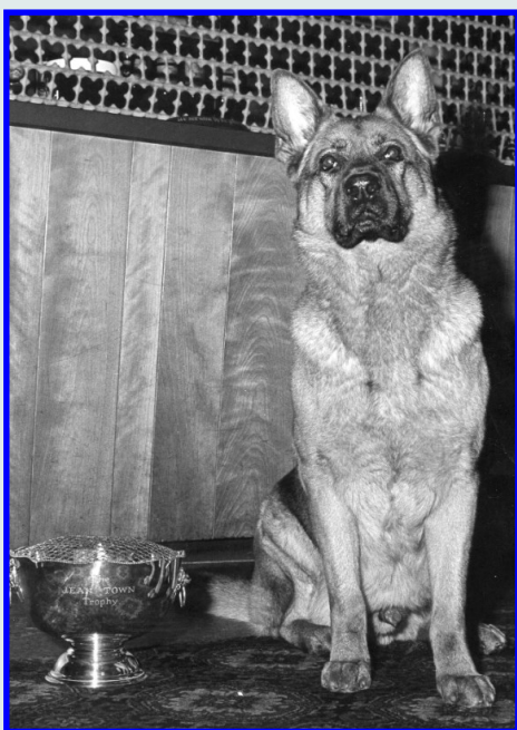
Hades with the JEAN TOWN TROPHY, 1977

Awarded by Kent CID for the best arrest using a police dog in that year.