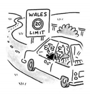
We're going to be late. I'll get out, run ahead and tell them you're on your way'