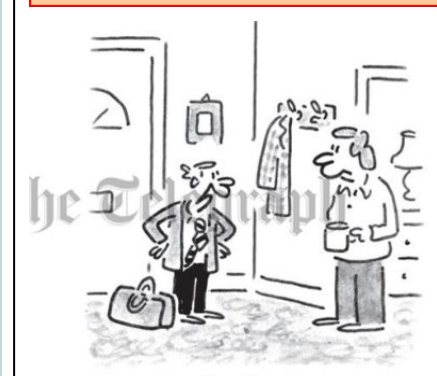
'At school today a teacher misgendered my imaginary friend'